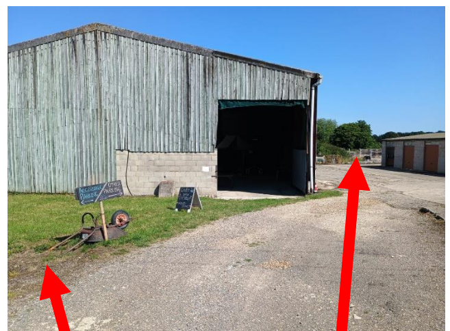
Accessible parking is just outside the shed.