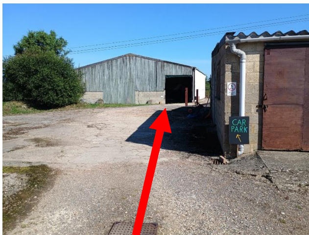
This is the farm driveway. The show is in the Big Shed in front of you

If you have access needs, you will be able to park right outside the Big Shed.