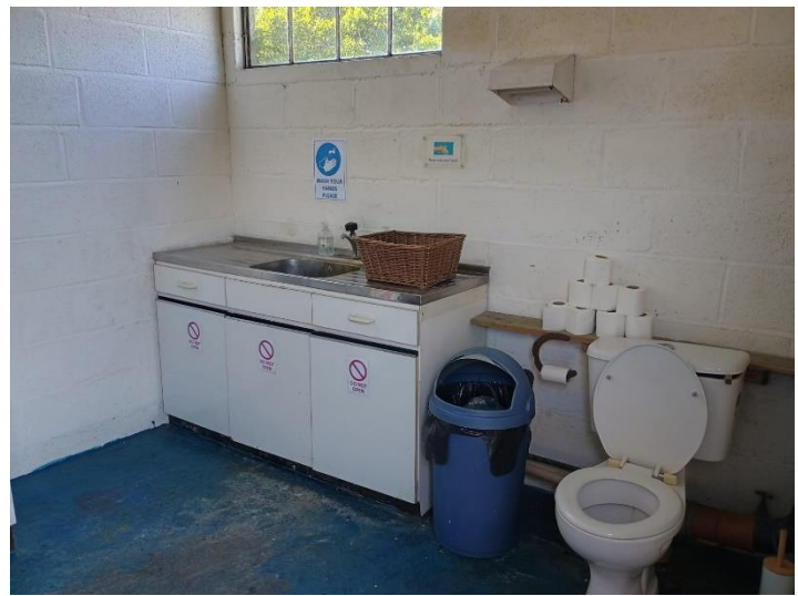
This is what the toilet looks like.

There is a chill out space in the shed, where there are some beanbags, chairs and colouring.